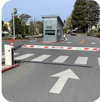
PARKING BARRIER ARMS